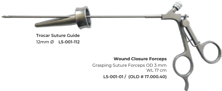
Trocar Suture Guide 12mm Ø L5-001-112