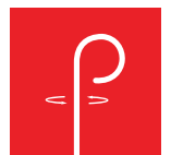
1:1 Torque Ratio