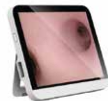
Image Resolution 1080 p (400x400 native pixels)