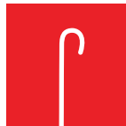
Greater Tip Range of Motion