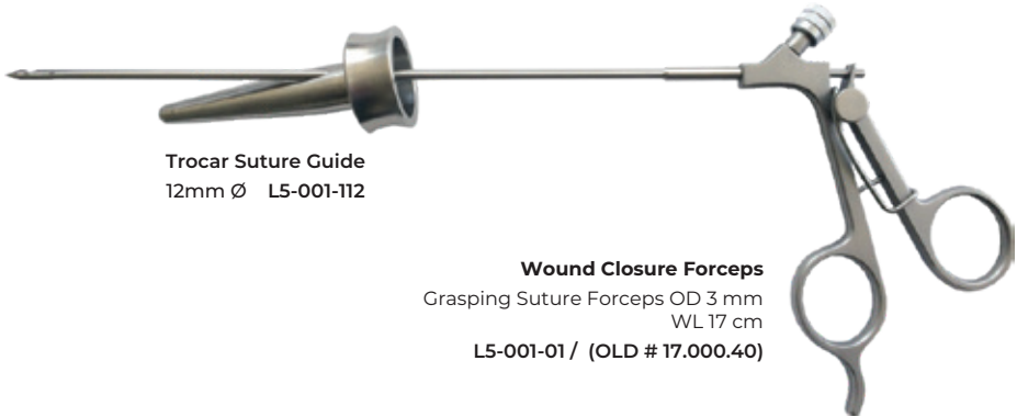
Trocar Suture Guide 12mm Ø L5-001-112