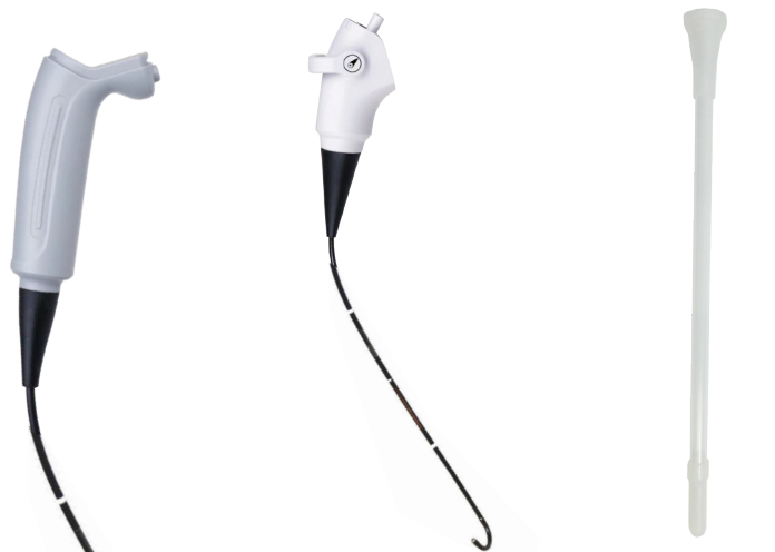
Reusable Handle Code: E-HR

The ultra-fine smooth insertion tube makes the patient more "insensitive"